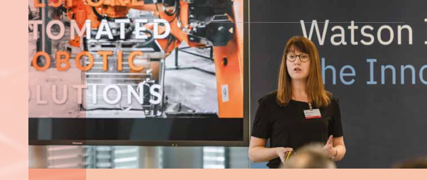
Image credit: Philippa Glover, CNC Robotics, from the DIT Tech Champions Mission, Munich

In a world when more women than ever are working, 15.3m or 71.4% of women over 16 were working in the UK in 2017, we need a game changer to ensure that more young people and especially girls progress into jobs that meet future STEAM needs and create products and services fit for all. Excellent STEM engagement and Careers Advice is occurring across the country, but mainly as extras to an already overloaded school curriculum, and focussed at secondary aged pupils. Instead we need to start young, put STEAM front-and-centre within education, and work together to increase our STEAM numbers tenfold - a hundredfold - across the country. We need to act, and we need to act now.